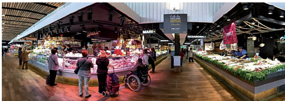
Optimal overview and service optimization

is developing a joint solution for cash register integration with intelligent IP cameras from MOBOTIX. This involves linking the transaction data for each sales process with video data and saving it directly in the camera.