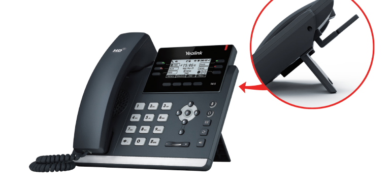
Easy Deployment without Wired LAN