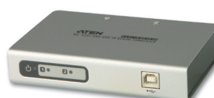
UC4852 2-Port USB-to-Serial RS-422/485 Hub