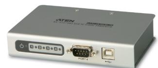
UC4854 4-Port USB-to-Serial RS-422/485 Hub