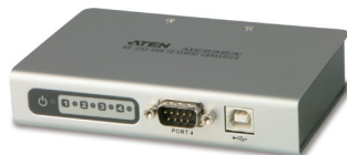
UC2324 4-Port USB-to-Serial RS-232 Hub