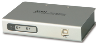
UC2322 2-Port USB-to-Serial RS-232 Hub