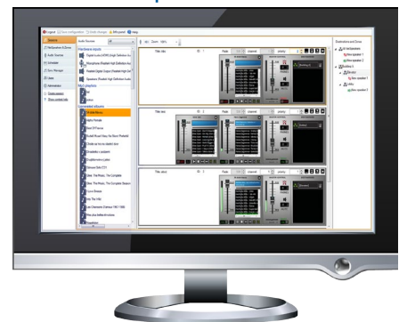
2N® NetSpeaker Console