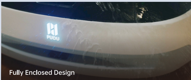
Fully Enclosed Design