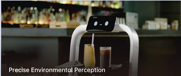
Precise Environmental Perception