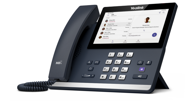
th Hybrid Mode