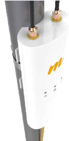
C5c on Pole