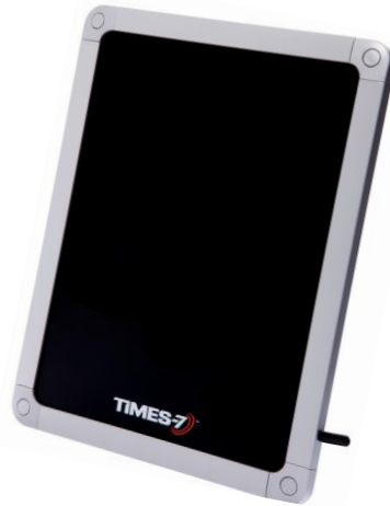
The SlimLine A6031