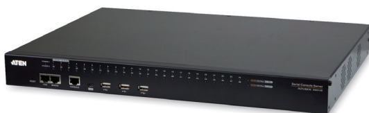
SN0148 Front View